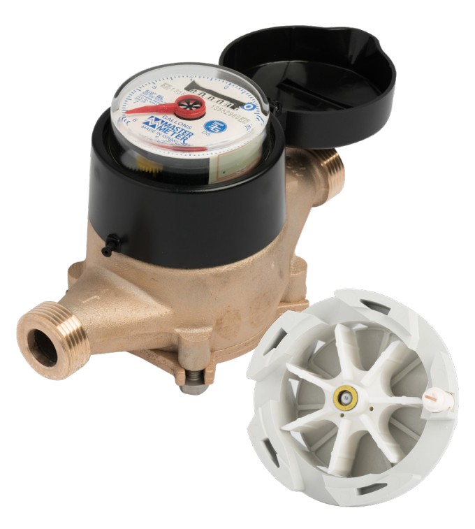
Shown with 3G Mobile AMR register endpoint and internal MJ measurement chamber