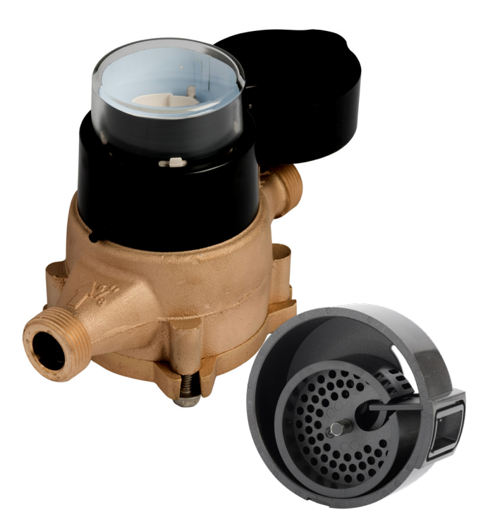
Shown with Allegro AMI register endpoint and internal PD measurement chamber