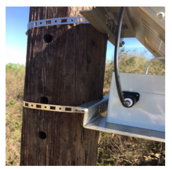
Figure 2: Completed Installation of Allegro AC Repeater