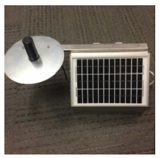
Figure 1: Allegro Solar Repeater (Front, Back, and Side)

Once the straps are put through the back of the solar repeater, and the straps are wrapped around the pole and secured tightly; installation is complete.