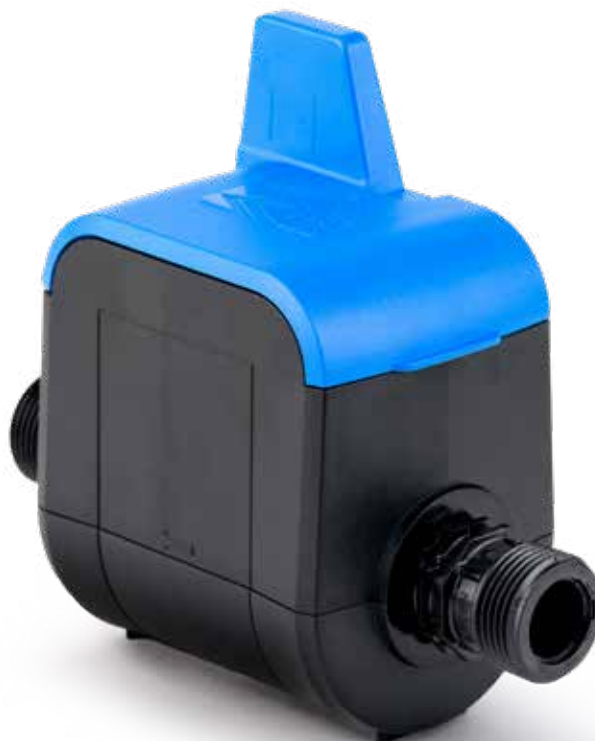
Sonata Allegro Ultrasonic Meter: With integrated AMI and reliable licensed network performance.