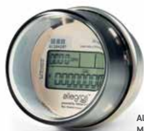
Allegro Mobile AMR

Unsure of which measuring system is best for your needs? Talk to a Master Meter expert today.