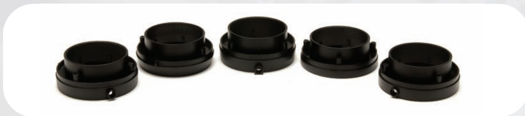
Adapter Rings to fit a variety of competitive meters: AMCO, Hersey, Badger, Neptune, and Sensus SR II, Precision

TAMPER RESISTANT DESIGN: Tamper resistant plugs are used to secure the register to the body and provide visual indication of tamper attempts. The total absence of wires, external antennas or batteries, further reduces the temptation for tamper.