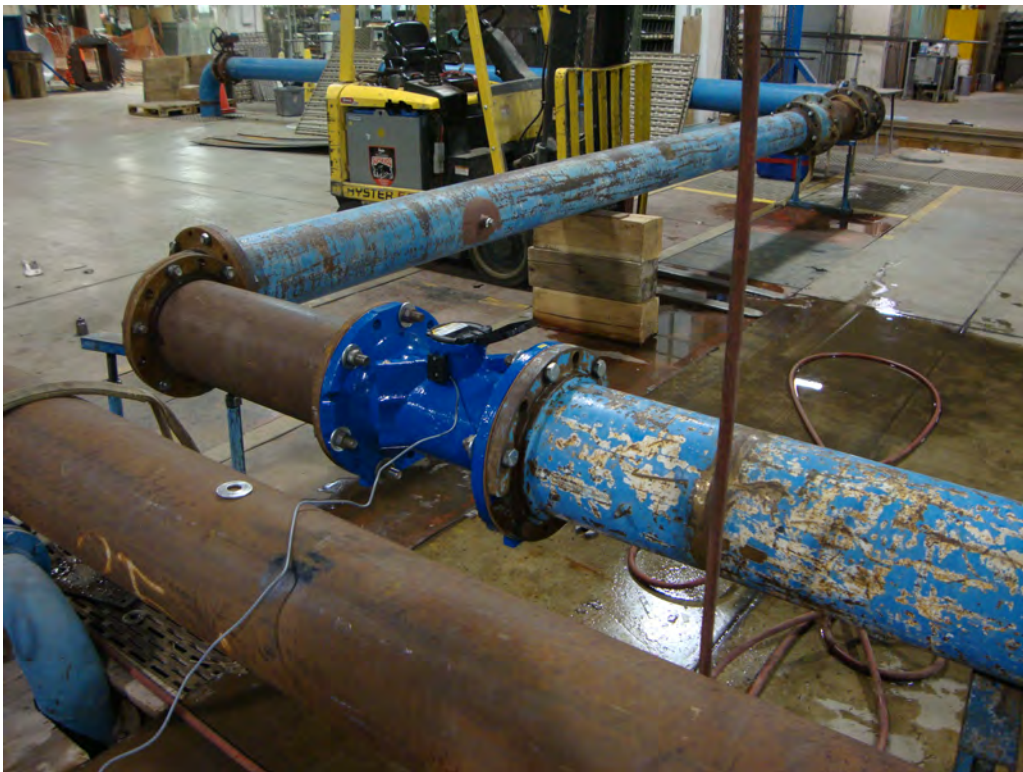
Figure 2 – Pipe Setup for Elbow Test (flow goes left to right)