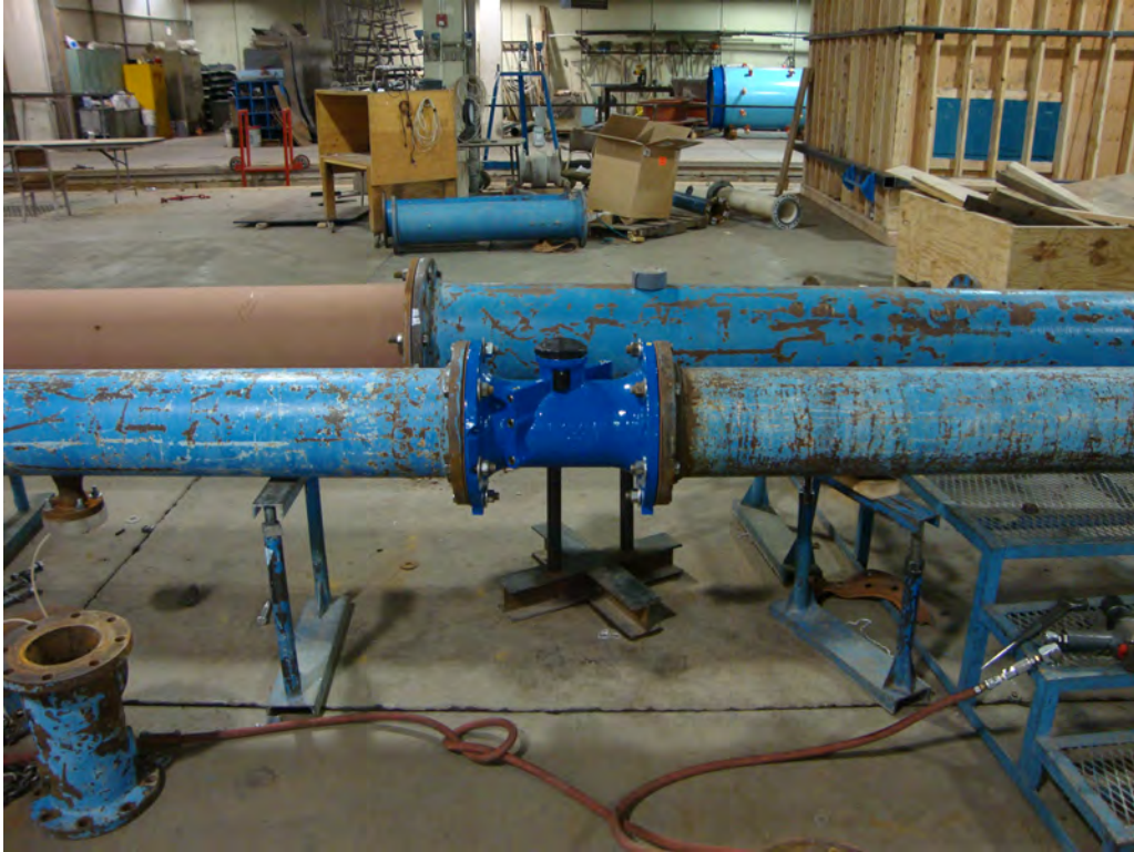
Figure 1 – Pipe Setup for Straight Pipe Test (flow goes left to right)